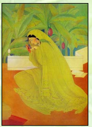
Hiraman Tota painting by M. A. R. Chugtai

Painting is naturally the most sensuous of the arts, and the highest greatness open to the painter is to spiritualise this sensuous appeal by making the most vivid outward beauty a revelation of subtle spiritual emotion so that the soul and the sense are at harmony in the deepest and finest richness of both and united in their satisfied consonant expression of the inner significances of things and life.